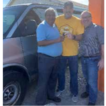
Van delivered to Nuevo Laredo

I pray these comforting truths leap from these pages and are etched on your soul, riveted in your mind, and seared onto your heart by the incomparable Holy Spirit; that you would become captivated and saturated with the marvel and marvelous nature of an ever-loving Savior. He is the real Marvel character!