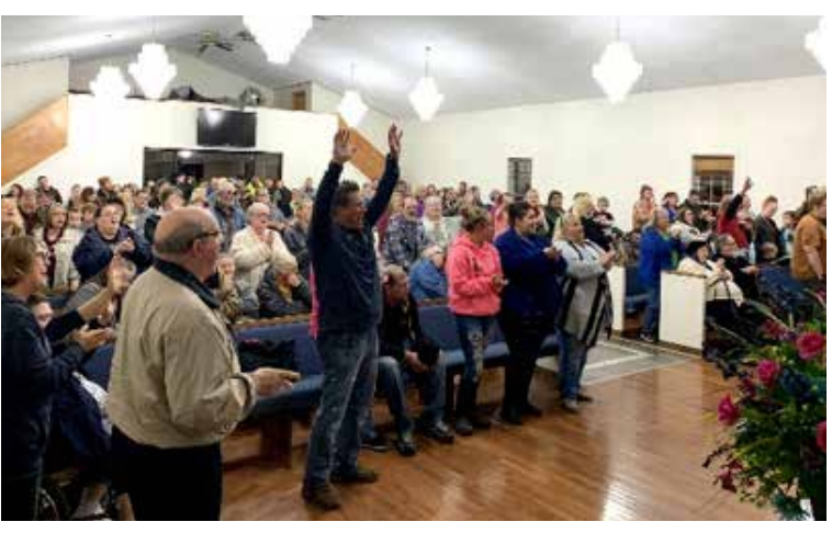
Worship Service in West Virginia