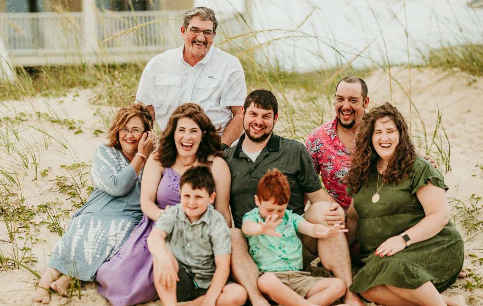
The Poole Family