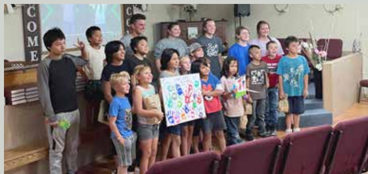
Below: VBS kids with project presented to the church.