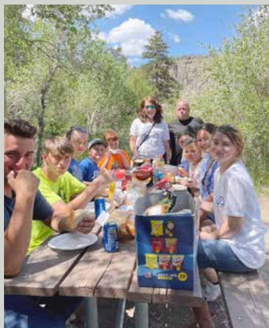
Left: SMYLE group enjoys lunch and sightseeing after ministry labor.